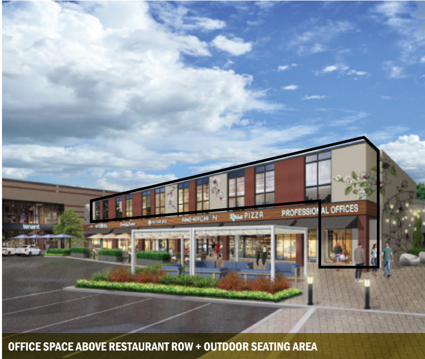
OFFICE SPACE ABOVE RESTAURANT ROW + OUTDOOR SEATING AREA

212-45 26th Avenue, Bayside, NY 11360 | bayterrace.com