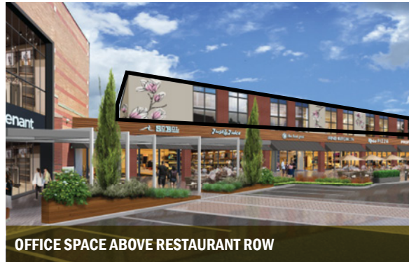
OFFICE SPACE ABOVE RESTAURANT ROW