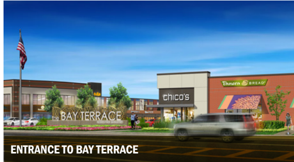
ENTRANCE TO BAY TERRACE