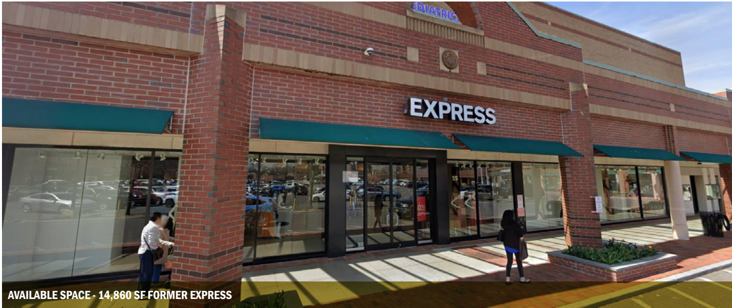
AVAILABLE SPACE - 14,860 SF FORMER EXPRESS

211-23/31 26th Avenue, Bayside, NY 11360 | bayterrace.com