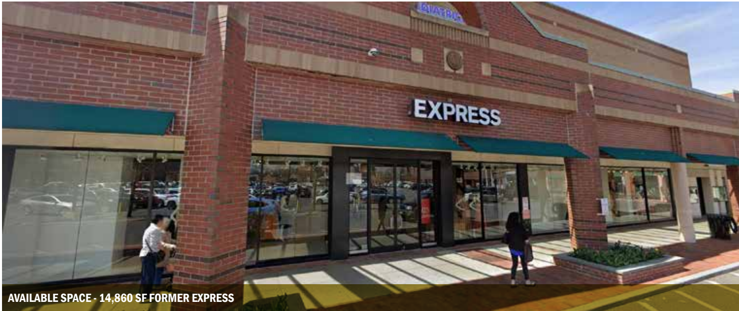
AVAILABLE SPACE - 14,860 SF FORMER EXPRESS

211-23/31 26th Avenue, Bayside, NY 11360 | bayterrace.com